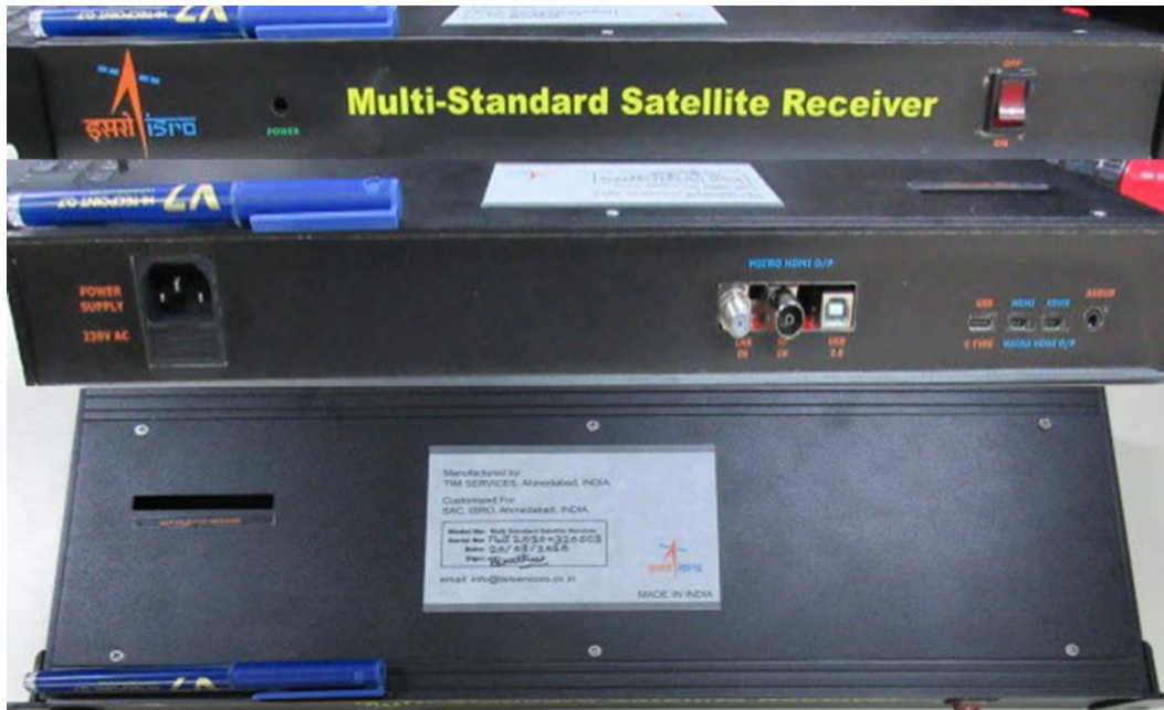
Integrated module, size:1U (can be further decreased by vertical PCBs stacking)

Space Applications Centre (SAC) has developed a low cost satellite receiver by Interfacing a USB TV tuner and Raspberry pi supporting multiple digital TV standards such as DVB-C/T/S/S2/S2x with tuning range from 950-2150 MHz at 1-45 Msps symbol rate for DVB-S/S2 standard and is successfully tested with GSAT-19 satellite link for the reception of Audio, video and data simultaneously for different symbol rates. In-house developed Akashganga application (A data repository application for admin and client side) is successfully deployed and tested on developed low cost receiver. The developed system can serve as an improvement for existing DTH set top box with data port at low cost.